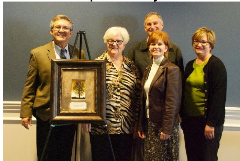
The brains and brawn behind MLC

We want to recognize the Metroplex Literacy Conference organizers for their tremendous achievement through this year's successful conference.