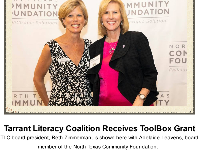
Tarrant Literacy Coalition is pleased to announce that the Coalition has received a grant from the ToolBox Grants Fund at the North Texas Community Foundation.

The North Texas Community Foundation, a permanent collection of charitable funds supported by donors, serves 11 counties in the North Texas region. The Community Foundation helps civic leaders, nonprofits and donors apply